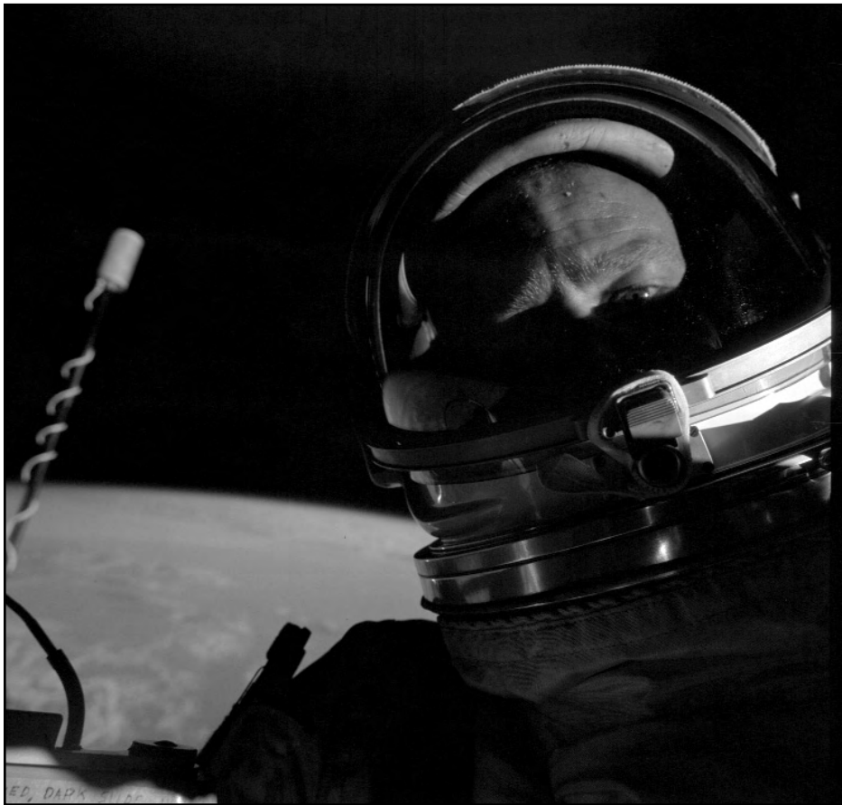
Buzz Aldrin, Gemini XII, 1966.

way to think about how many humans “Spaceship Earth” could support.